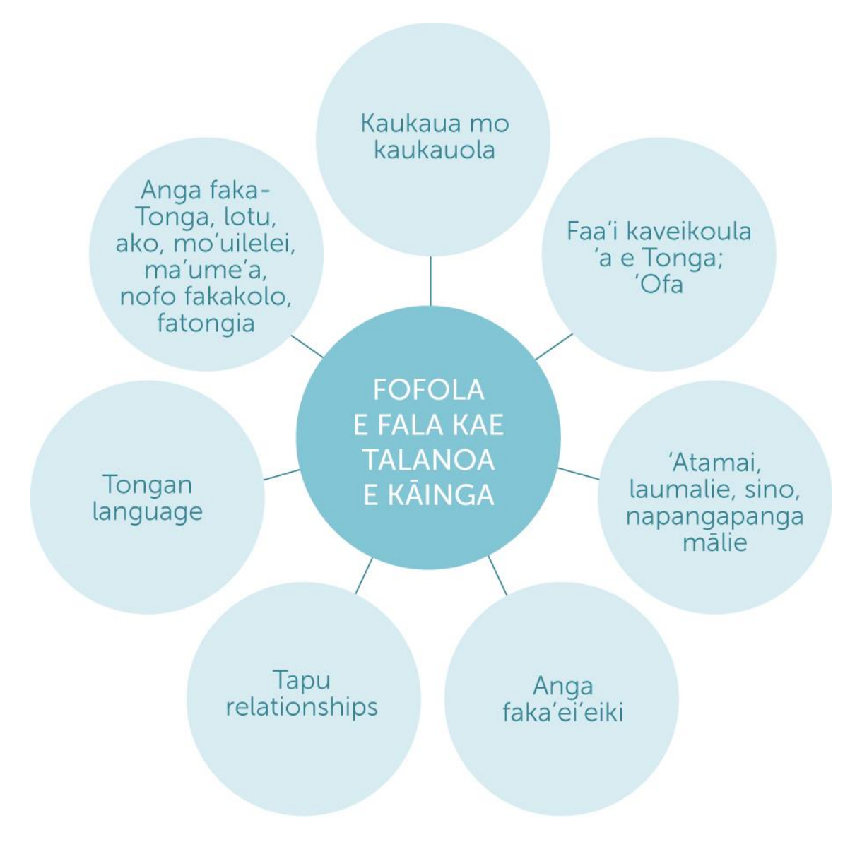
Figure 2. Pathways to and from fofola e fala kae talanoa e kāinga

A feature of the Tongan worldview is that it is largely informed by 'rank consciousness'. Individuals hold different positions and rank in a range of situations: